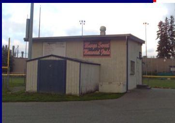
Existing Snack Shack and equipment storage building.

“The current Club House and related facilities are in poor condition, are inefficient in their configuration, and aged beyond their useful life.”