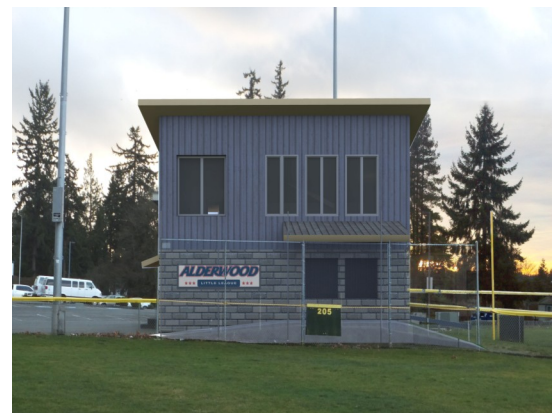
New Club House for Alderwood Little League.

For over 50 years Alderwood Little League has been providing a program that makes a difference by inspiring and enabling the healthy development of all young people, from every circumstance, to realize their full potential as productive, responsible and caring members of our community. Today Alderwood Little League supports nearly 500 children and their families annually from within the communities of Lynnwood, Brier, Bothell, Mountlake Terrace and Edmonds. Our mission is to “implant firmly in the children of the community the ideals of great sportsmanship, honesty, courage, and respect for authority, so that they may be well adjusted, stronger and happier children and will grow to be great, decent, healthy and trustworthy citizens”. Since our inception in 1960 we have seen the organization evolve and mature like so many of the thousands of children who have passed through our program.