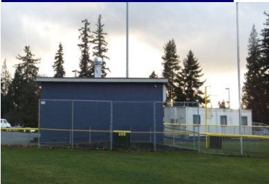
Existing office and Snack Shack for Alderwood Little League.

These factors have impacted our ability to invest in new equipment, complete field upgrades and make available scholarships and other services to support additional children and their families in our program.